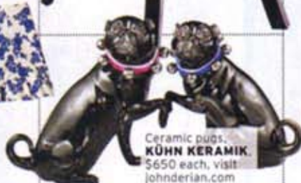
Ceramic pugs, KÜHN KERAMIK , $650 each, visit joehnderian.com