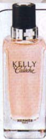
Kelly Calèche Eau de Toilette, HERMÈS , $110, visit usa.hermes.com