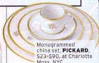
Monogrammed china set, PICKARD , $23-$90, at Charlotte Moss, NYC