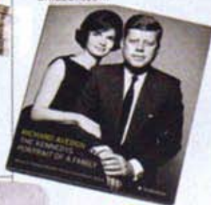
The Kennedys: Portrait of a Family , by RICHARD AVEDON , $29.95, visit amazon.com