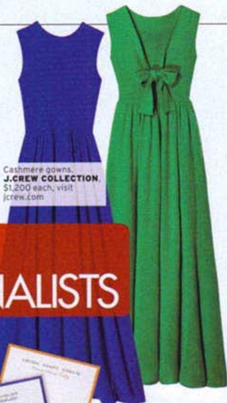
Cashmere gowns, J.CREW COLLECTION , $1,200 each, visit jcrew.com