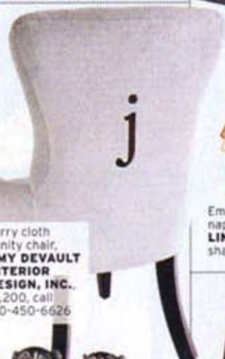
Terry cloth vanity chair, AMY DEVAULT INTERIOR DESIGN, INC. , $1,200, call 310-450-6626