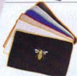
Embroidered cocktail napkins, SHARYN BLOND LINENS , visit sharynblondlinens.com