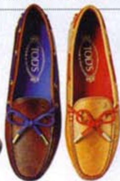
Calfskin shoes, TOD'S , $345 per pair, visit tods.com