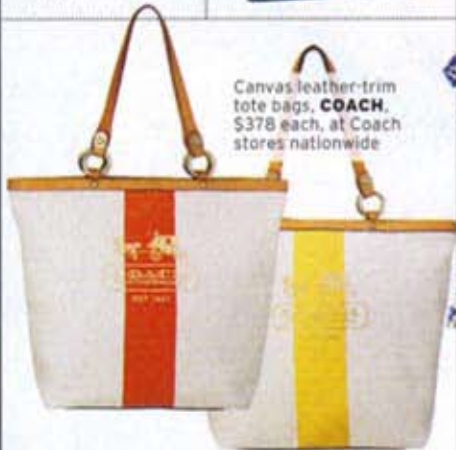
Canvas leather-trim tote bags, COACH , $378 each, at Coach stores nationwide