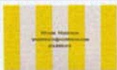
Kate Spade letterpressed calling cards, CRANE & CO. , $214, visit crane.com