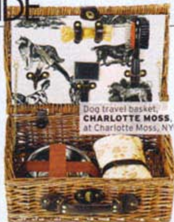
Dog travel basket, CHARLOTTE MOSS , $110, at Charlotte Moss, NYC