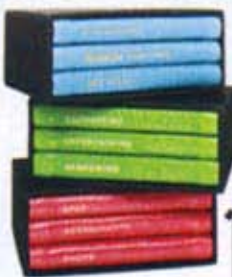
Leather-bound notebooks, CHARLOTTE MOSS , $85 per set, visit charlottemoss.com