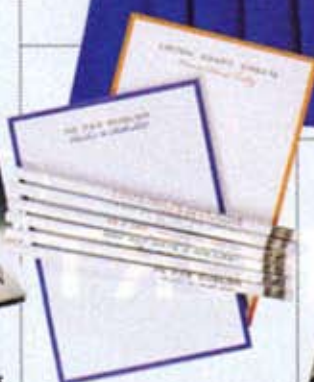
Quote pencils and notepads, CHARLOTTE MOSS , $10-$25, visit charlottemoss.com