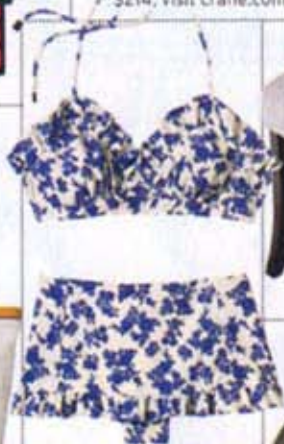
Nylon-blend swimsuit, ARAKS , $200, at La Petite Coquette, NYC